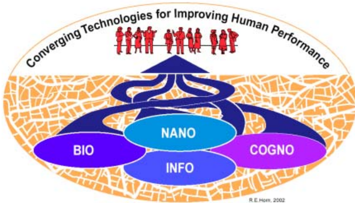
Changing the societal “fabric” towards a new structure (upper figure by R.E. Horn)

The integration and synergy of the four technologies (nano-bio-info-cogno) originate from the nanoscale. This picture suggests the implications of the converging technologies by remapping the main societal paths, towards more functional and coarser pathways instead of the less organized and finer mesh we have now, and with an increased focus on people. New patterns are envisioned in working habits, in economic activity, and in human civilization.